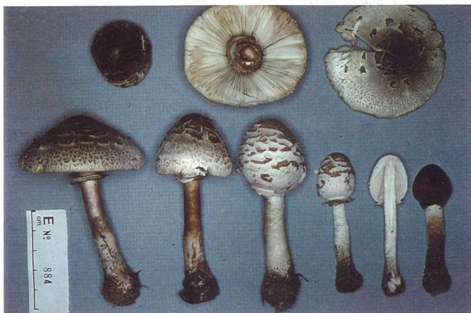
Figure 1. Developmental stages of Chlorophyllum molybdites fruit bodies from Floreat Park, Perth, Western Australia. Note the dark, coarse scales which develop on the pileus, and overall resemblance to species of Macrolepiota . The specimen shown at top centre had begun to develop greenish-tinged lamellae but had not yet matured fully. Photo: N.L. Bougher, February 1998.